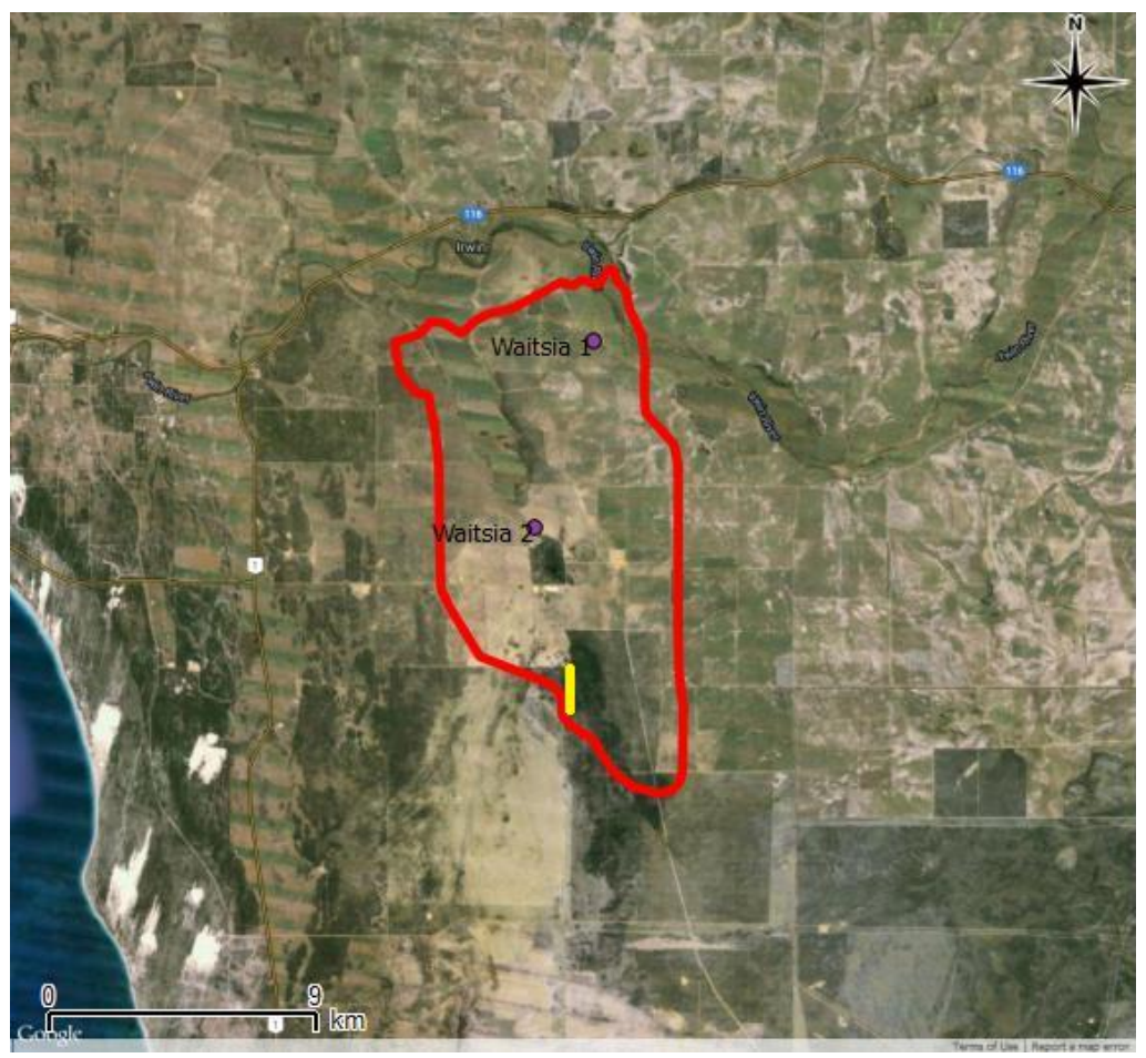
Figure 1. Location of Waitsia Wells survey area (red border). Waitsia 03 project area shown in yellow

The survey area is located east of Dongara and south of The Midlands Highway; approximately 300 kilometres north of Perth (Figure 1). The broader Waitsia project has a total area of approximately 8400 ha, dominated by cleared agricultural land but with some tracts of native vegetation. There is a spring in the central part of the area (Ejarno Spring) and the Irwin River runs through the north-eastern part of the site.