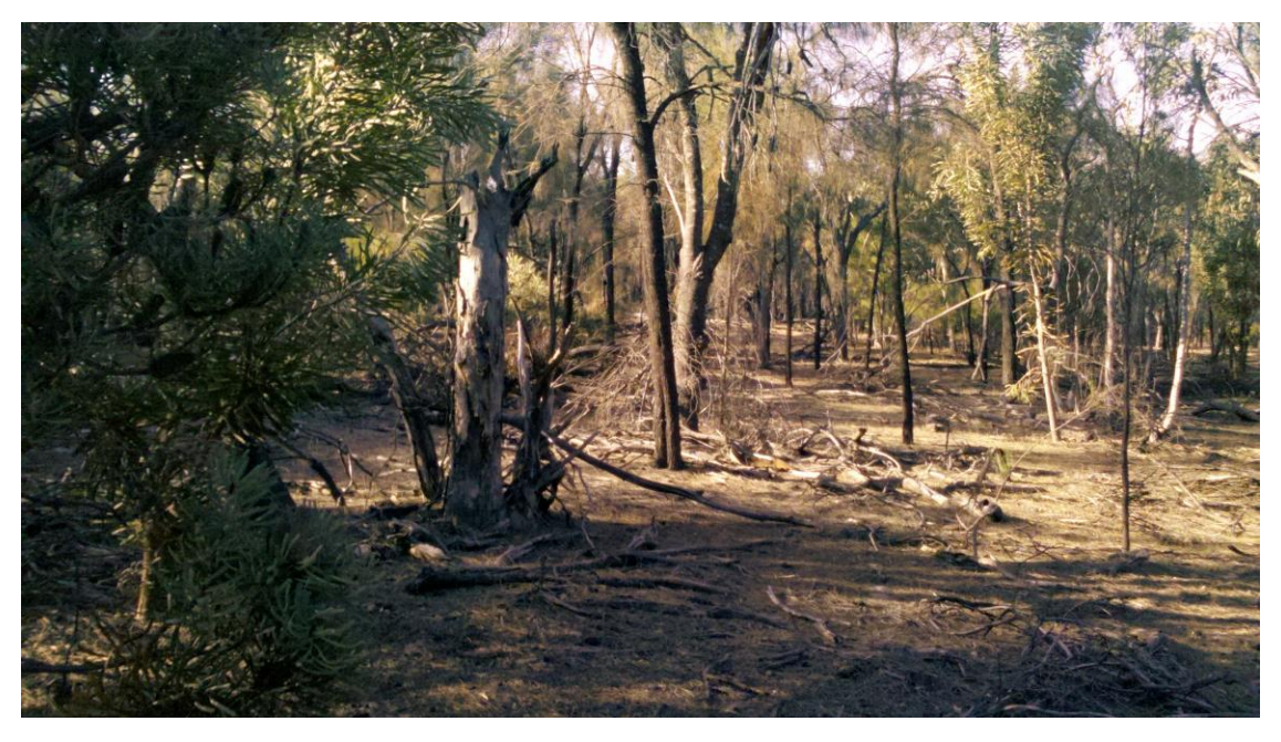
Plate 2. Allocasuarina woodland with Banksia – to the east of the well location.