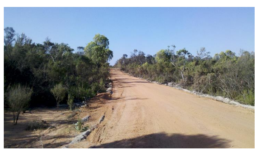
Existing track within the Waitsia 03 project area

Fauna Assessment of Waitsia 03 access track and pipeline with regard to the clearing principles detailed in Schedule 5, (WA) Environmental Protection Act 1986.