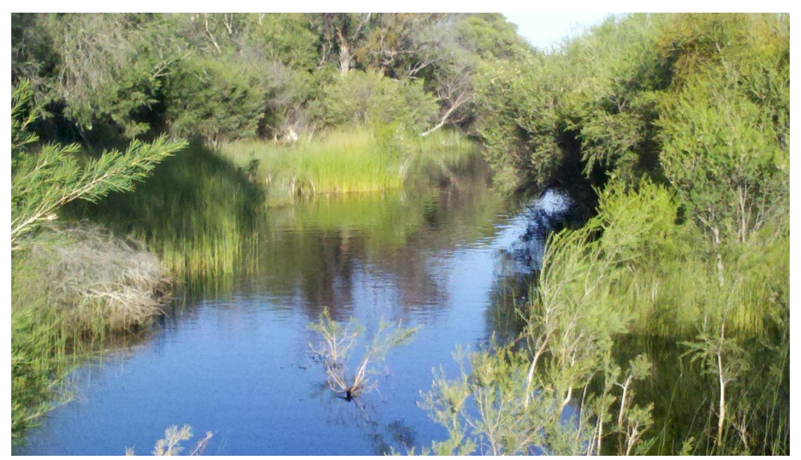
Plate 4. Wetland north-east of the well location.