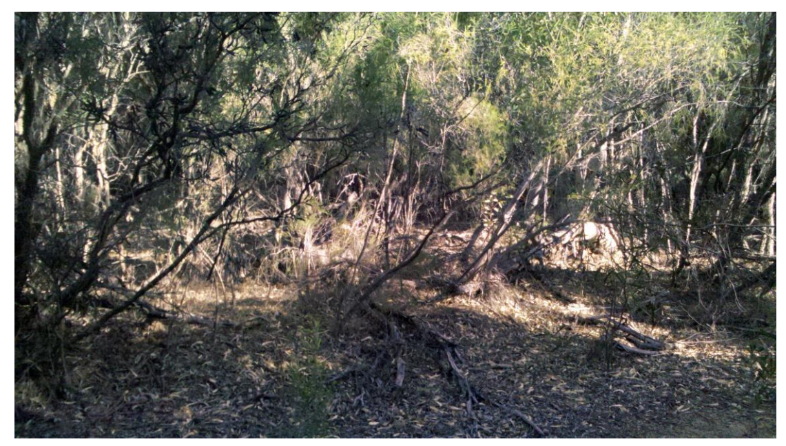
Plate 3. Melaleuca thicket to the east of the well location.