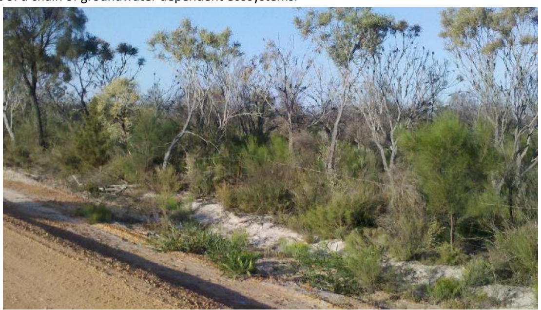
Plate 1. Banksia woodland east of the entrance track. This had been burnt within the previous two years.

north and native vegetation in the south), which means it may have more species (especially birds) using the site regularly than might otherwise be the case, and it has a role in supporting biodiversity in nearby areas. Hydrology is especially important at the Waitsia 03 site with a nearby dampland and wetland that is part of a chain of groundwater dependent ecosystems.