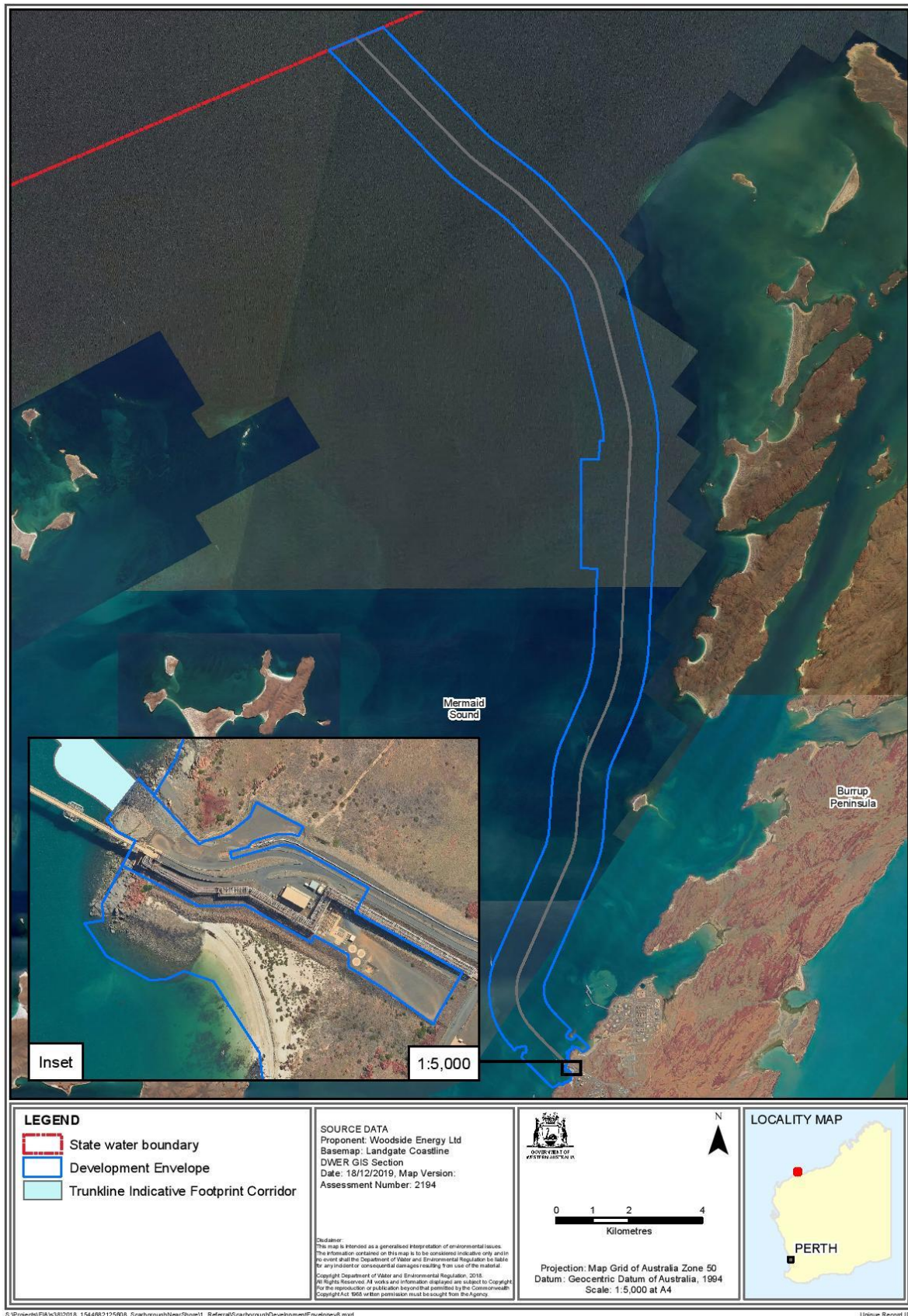
Figure 1: Development envelope and indicative footprint of the shore crossing site