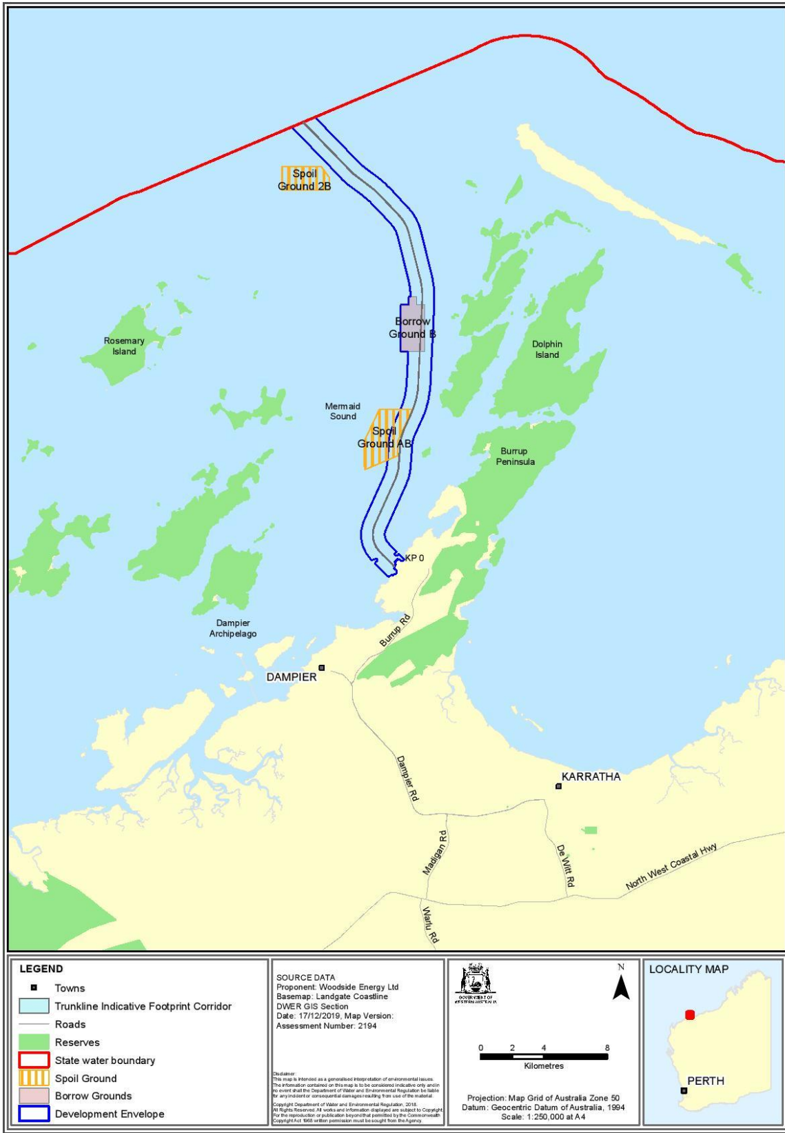
Figure 1: Regional location