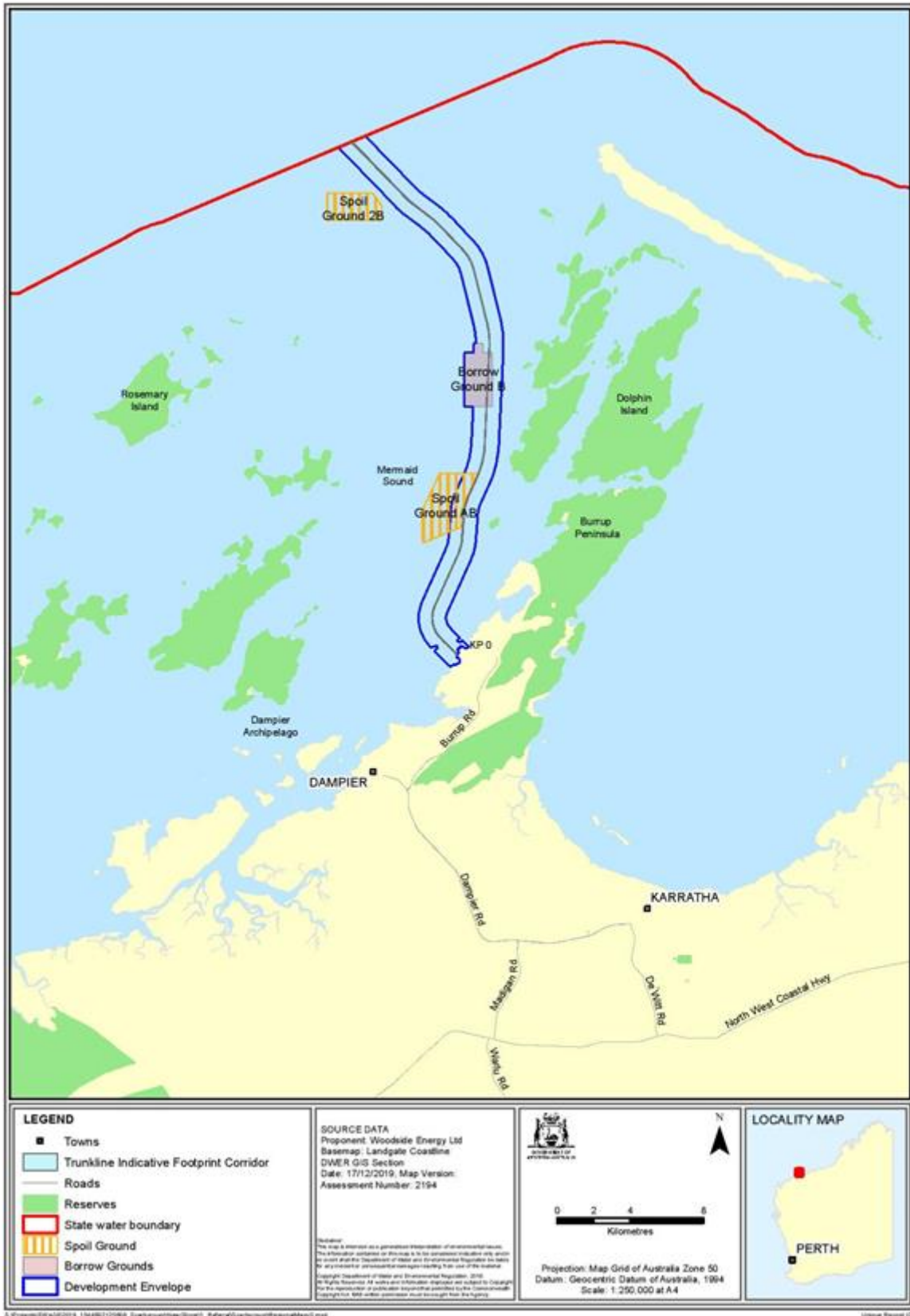
Figure 2: Development envelope and indicative footprint