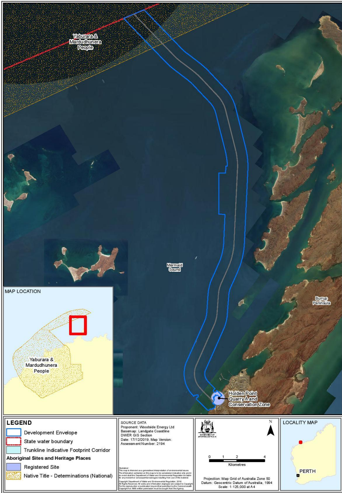
Figure 5: Native title claim and heritage site