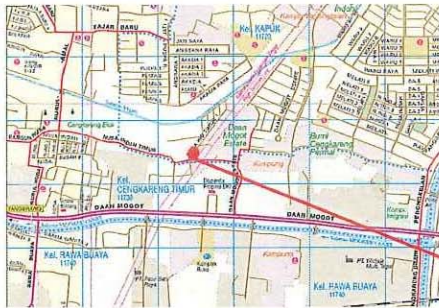
Daan Mogot Substation