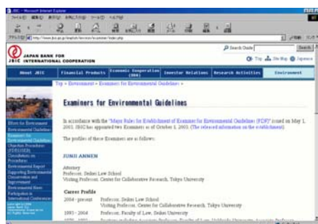
The web page on the Examiners

The Examiners inserted articles of the brief outlines of the Objection Procedures and profiles of the Examiners in “JBIC TODAY,” the JBIC’s newsletter, in order to introduce the Examiners themselves and their activities.