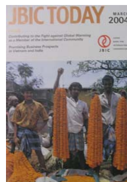
JBIC TODAY (March, 2004)